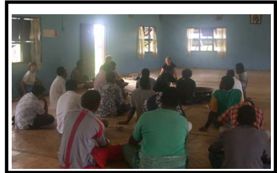
Participants of the workshop discuss the practicalities of setting up a sponge farm.

cutting and deploying sponges on long lines for culture.