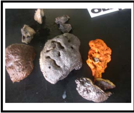
Sponges collected during the survey were used to demonstrate sponge cutting and deploying techniques.

cutting and deploying sponges on long lines for culture.